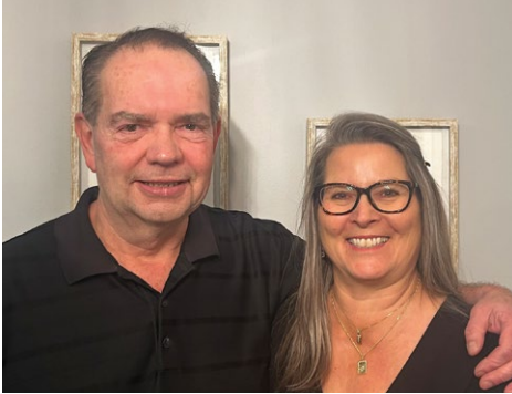
by Shane and Rhonda Free

The Communion Team prepares communion (breaks up the crackers, fills the trays with communion cups, pours the grape juice) before service and cleans up after. This is a behind-the-scenes ministry, but a very important one. The more volunteers we have, the less frequently each individual or couple is scheduled.